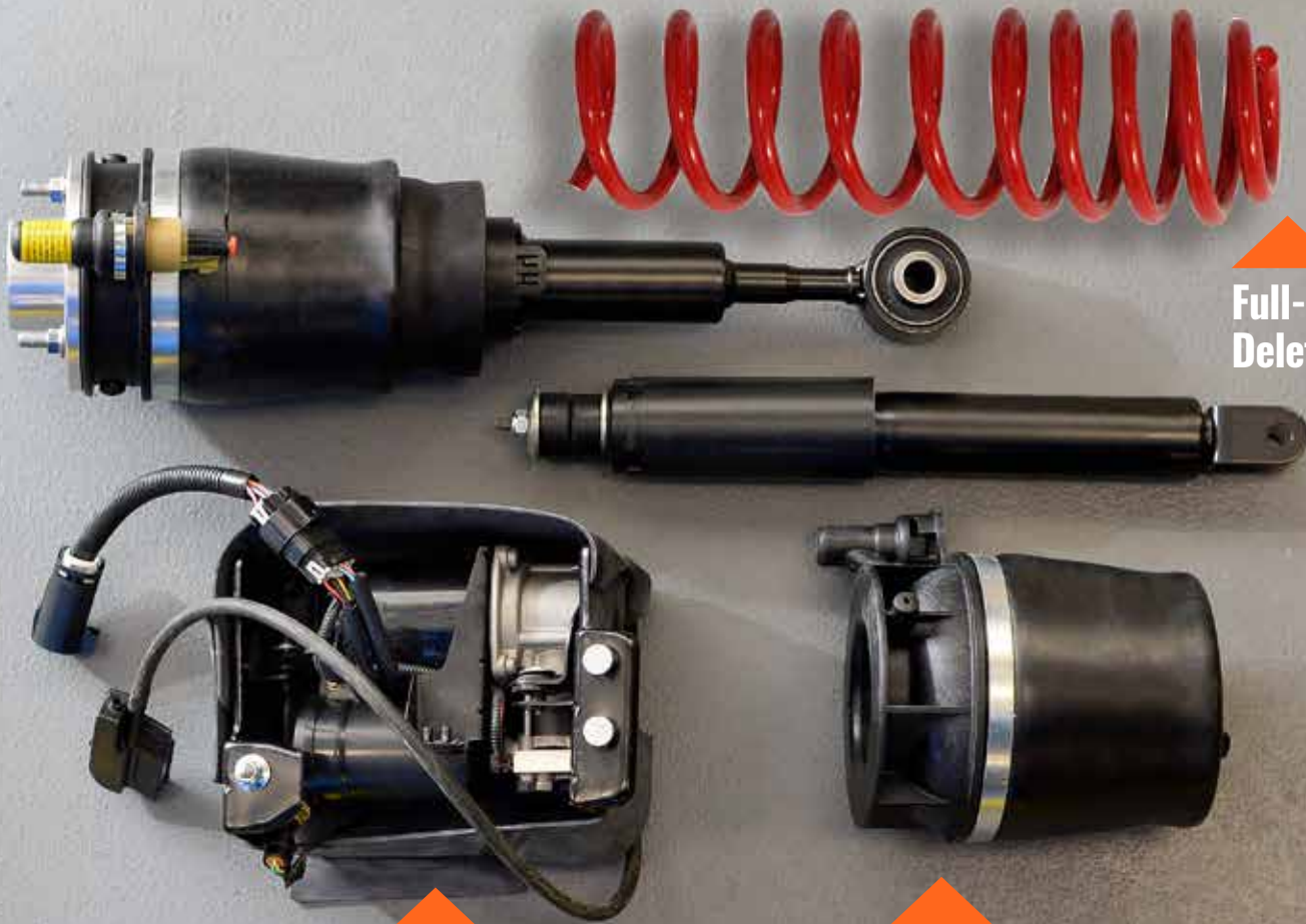
Full-Coverage Delete Kits

THE MOST TECHNOLOGICALLY ADVANCED AND COMPLETE LINE AVAILABLE IN THE AFTERMARKET